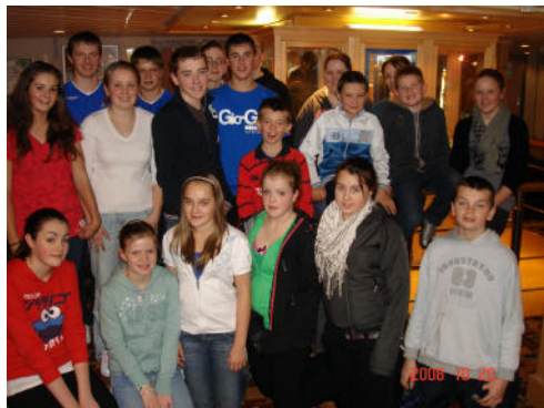
Group on the ferry - October 2008 trip to Inverness

It is good to hear these meetings specified before the Lord in the public prayers of the Lord's people, which shows that they are being remembered in private prayer also. This is so important, not only for the obvious reason that the blessing of God is something we must constantly pray for, but also so that our young people themselves will be assured that we think about them a lot, that we value them highly and that we want the best for them, which can mean only one thing - God's best.